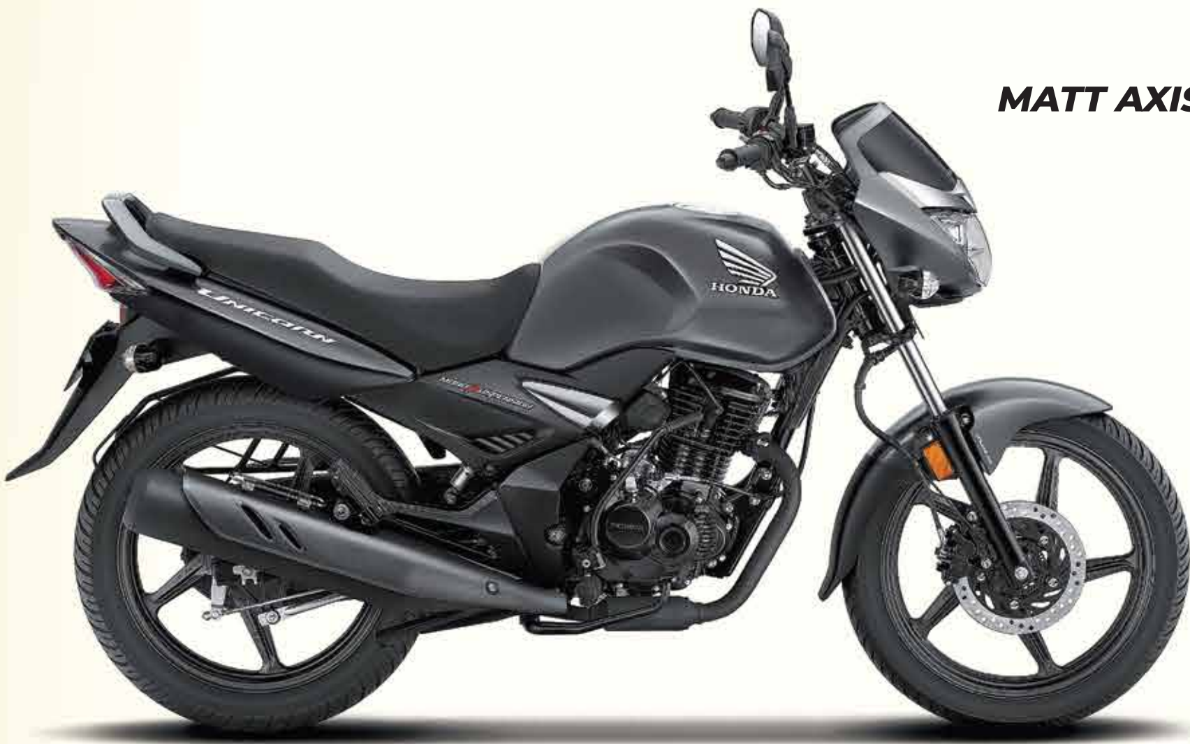
MATT AXIS GREY METALLIC